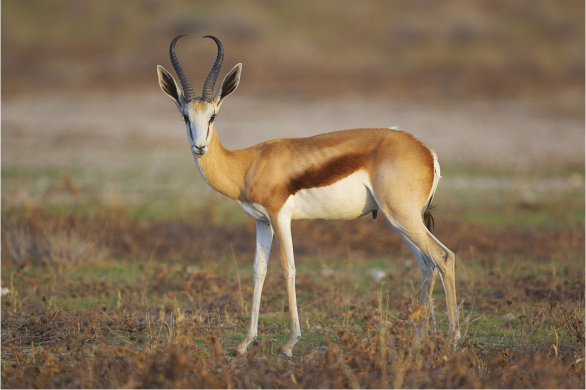
Figure 2.1. Antidorcas marsupialis , male

A simple calculation using the Schrödinger wave equation shows that